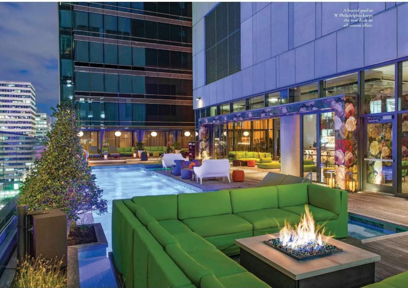
A heated pool at W Philadelphia keeps the roof deck an all-season affair.